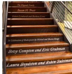
Chesapeake Shakespeare Company