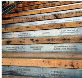
Wing Luke Museum, Seattle

Some examples of how other organizations have implemented this includes: