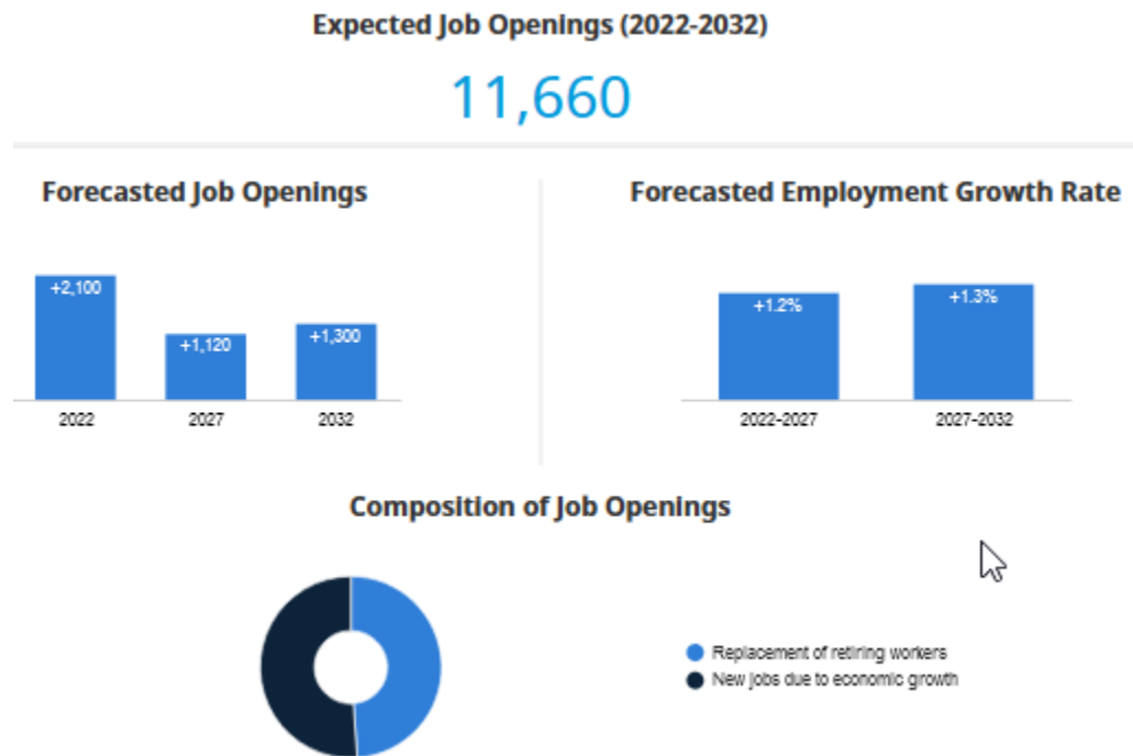
Chart from WorkBC