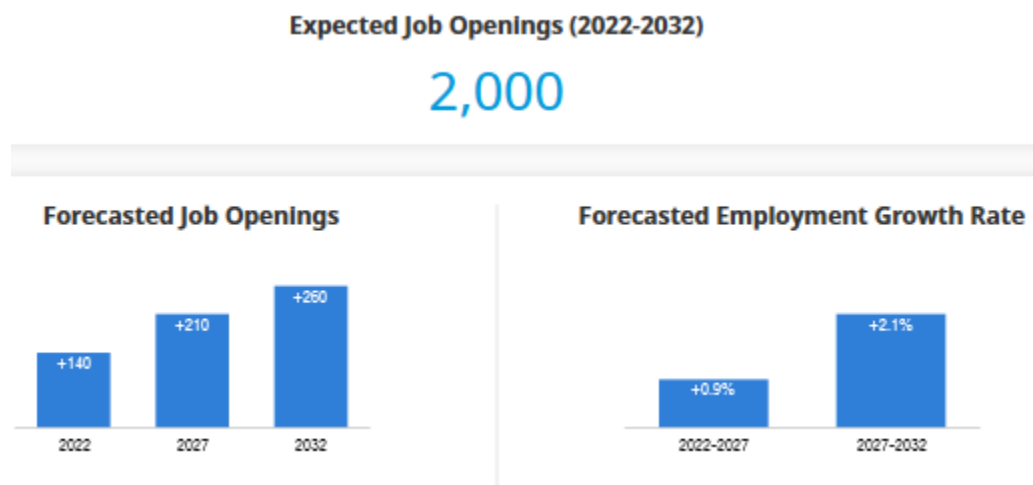
Chart from WorkBC