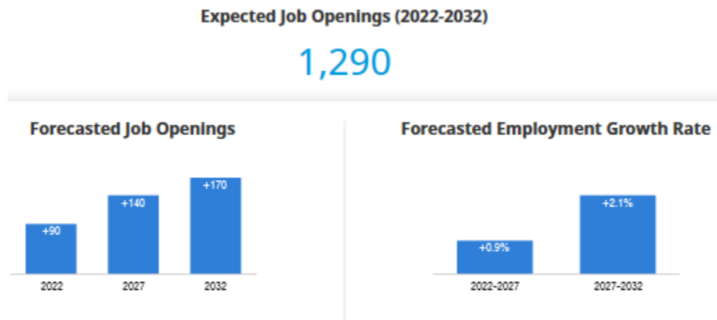
Chart from Work BC