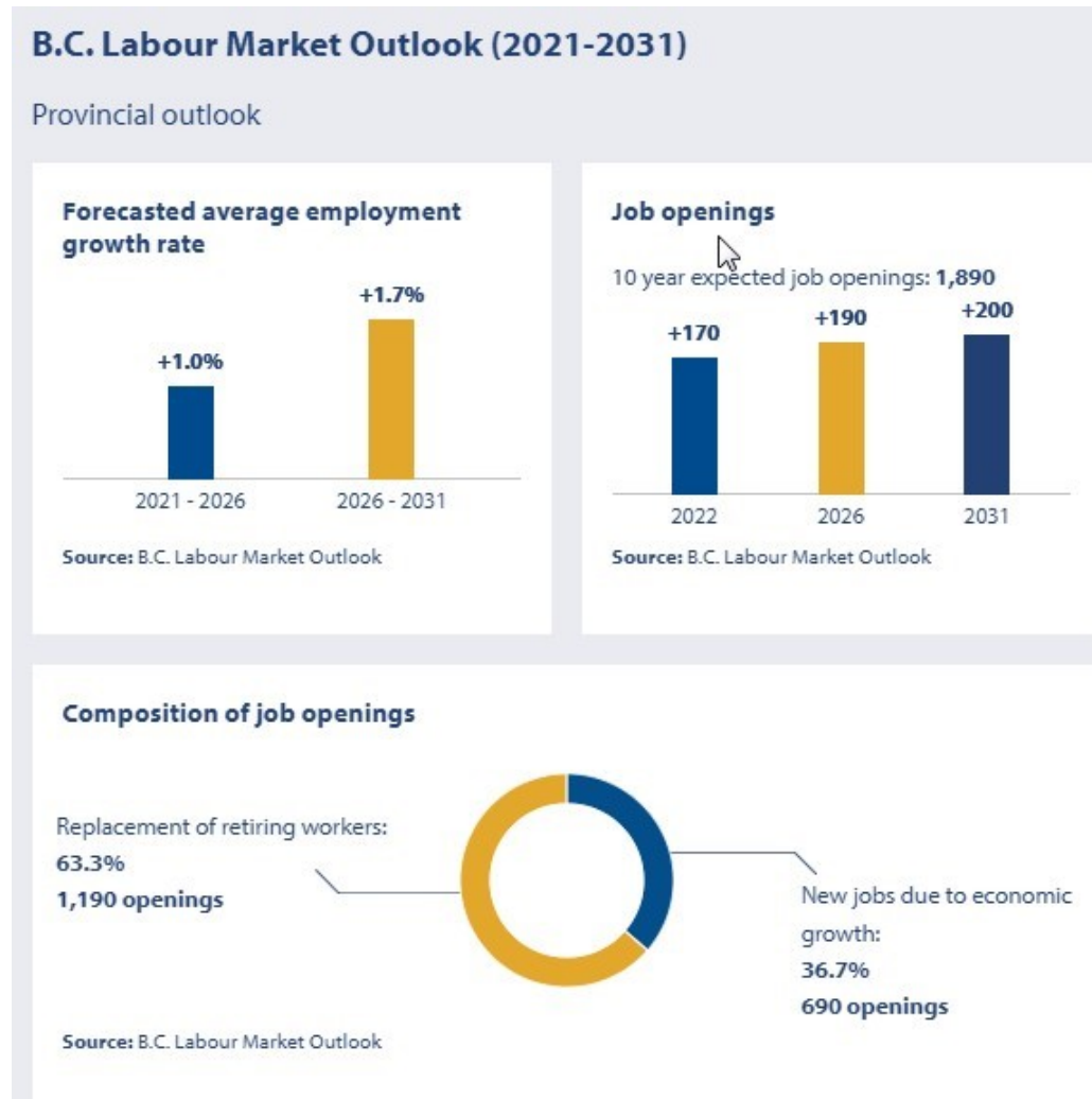
Chart from WorkBC