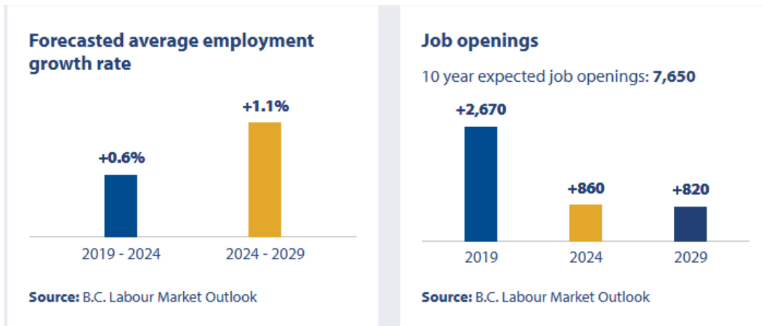
Chart from WorkBC